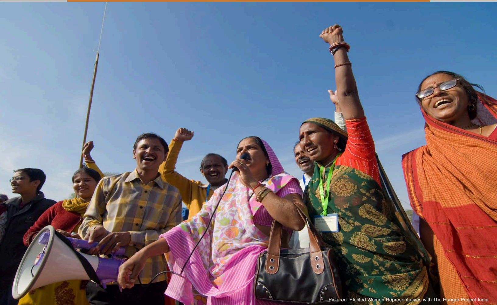
Pictured: Elected Women Representatives with The Hunger Project-India